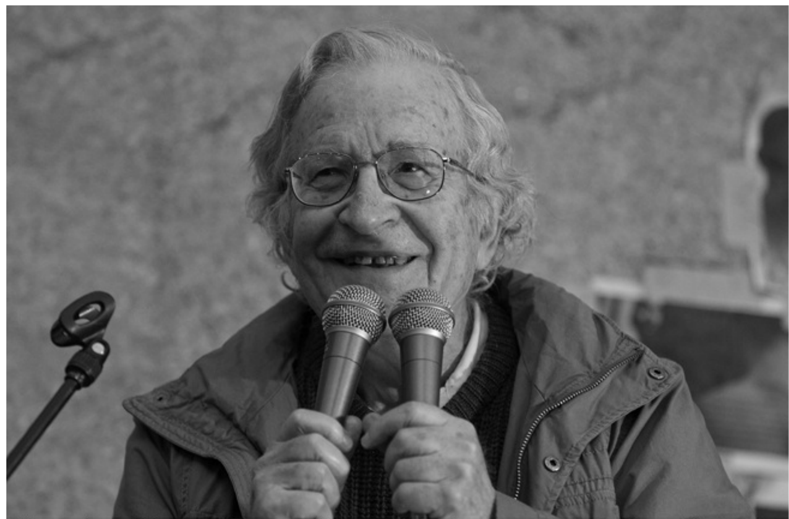
Chomsky addresses Occupy Boston, October 22, 2011