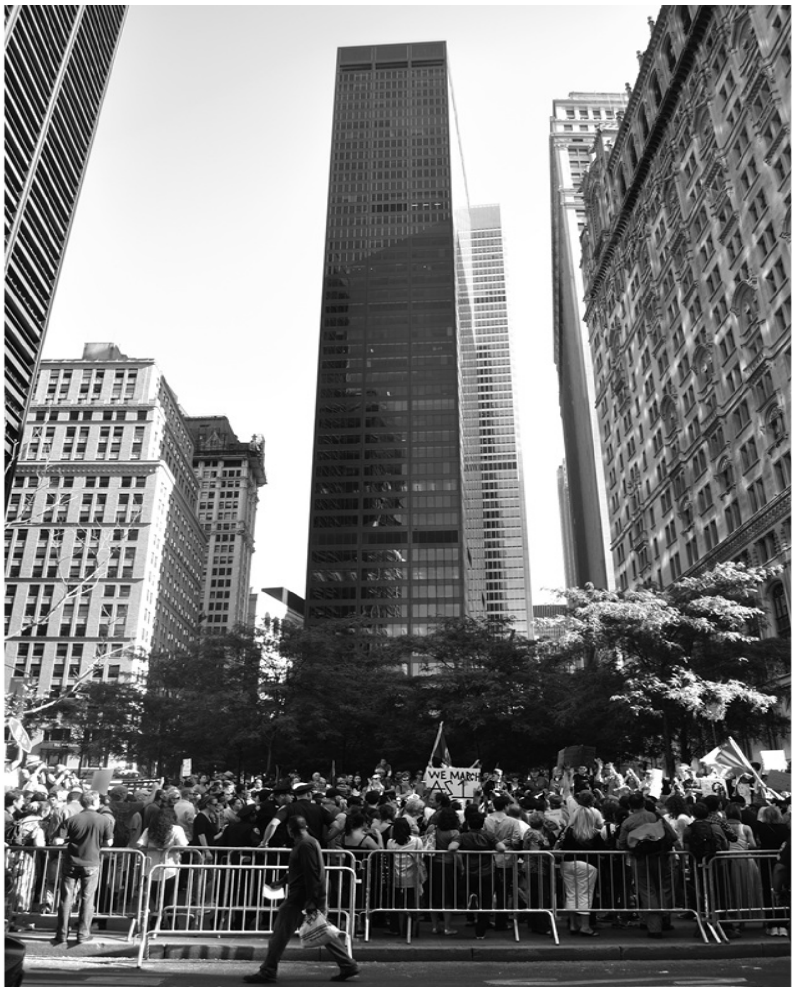
Zuccotti Park, 2011