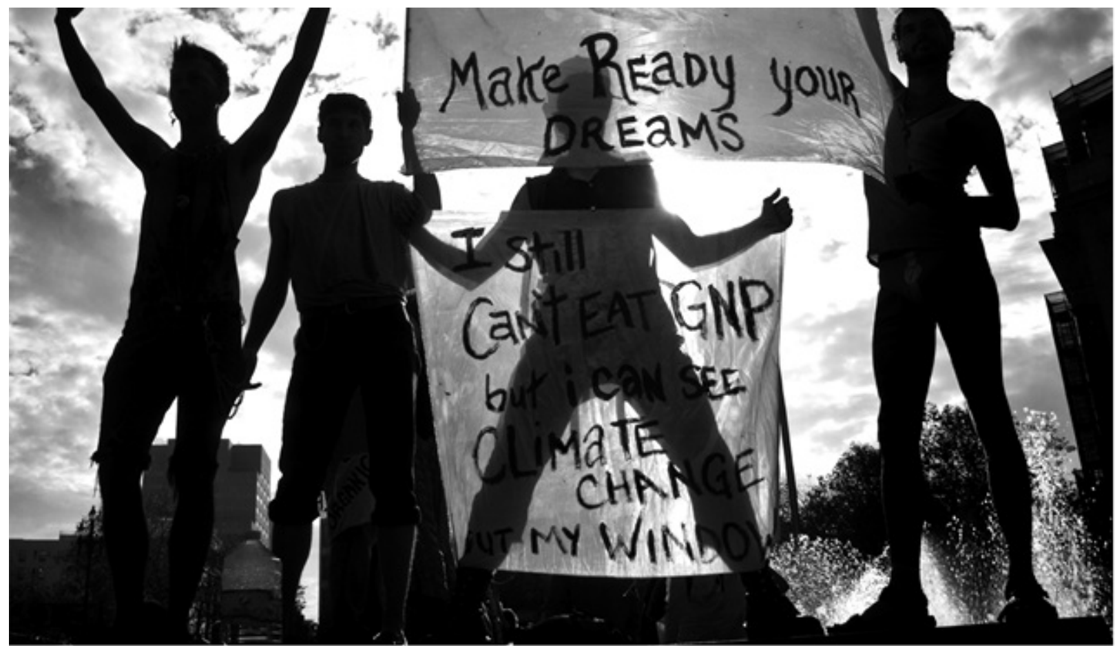
Occupy San Francisco, 2011