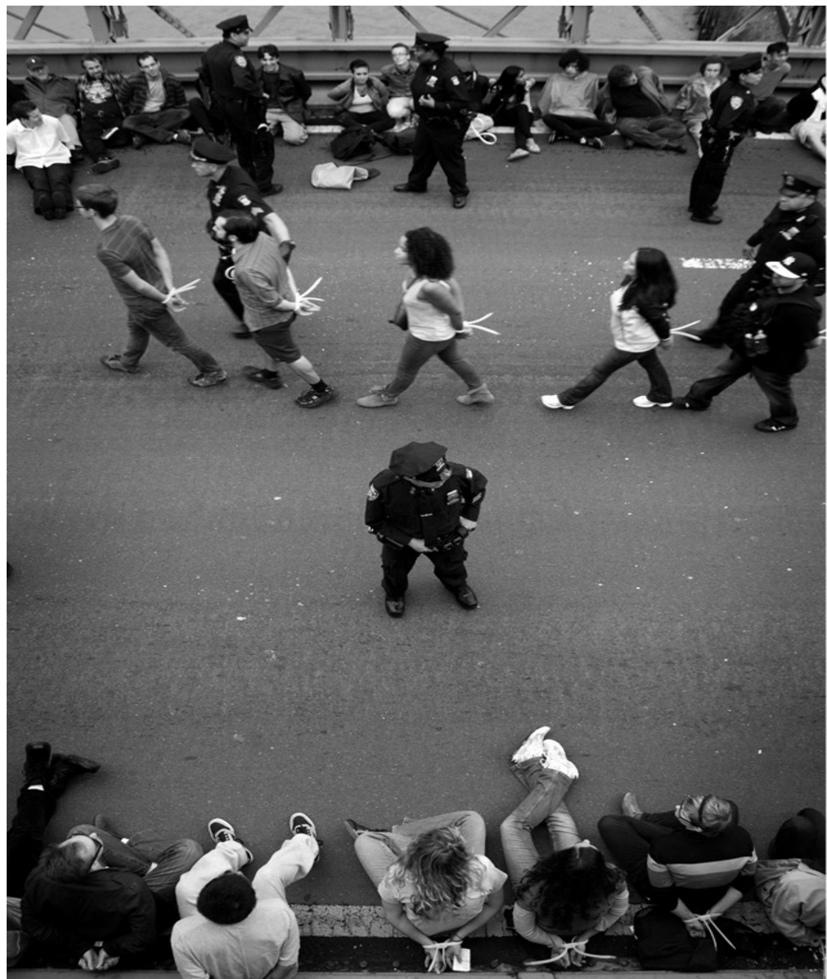
Brooklyn Bridge, October 1, 2011