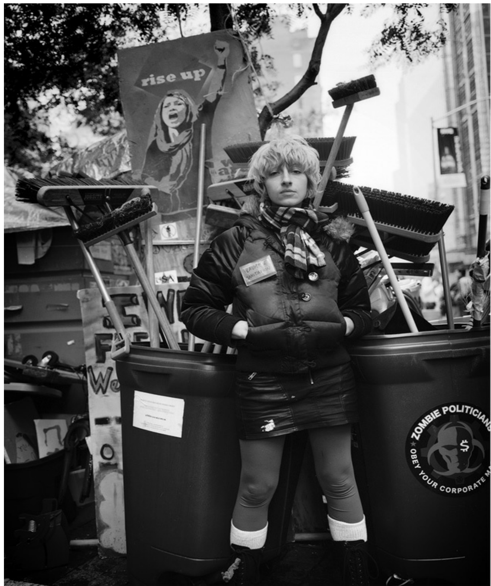
Zuccotti Park, 2011