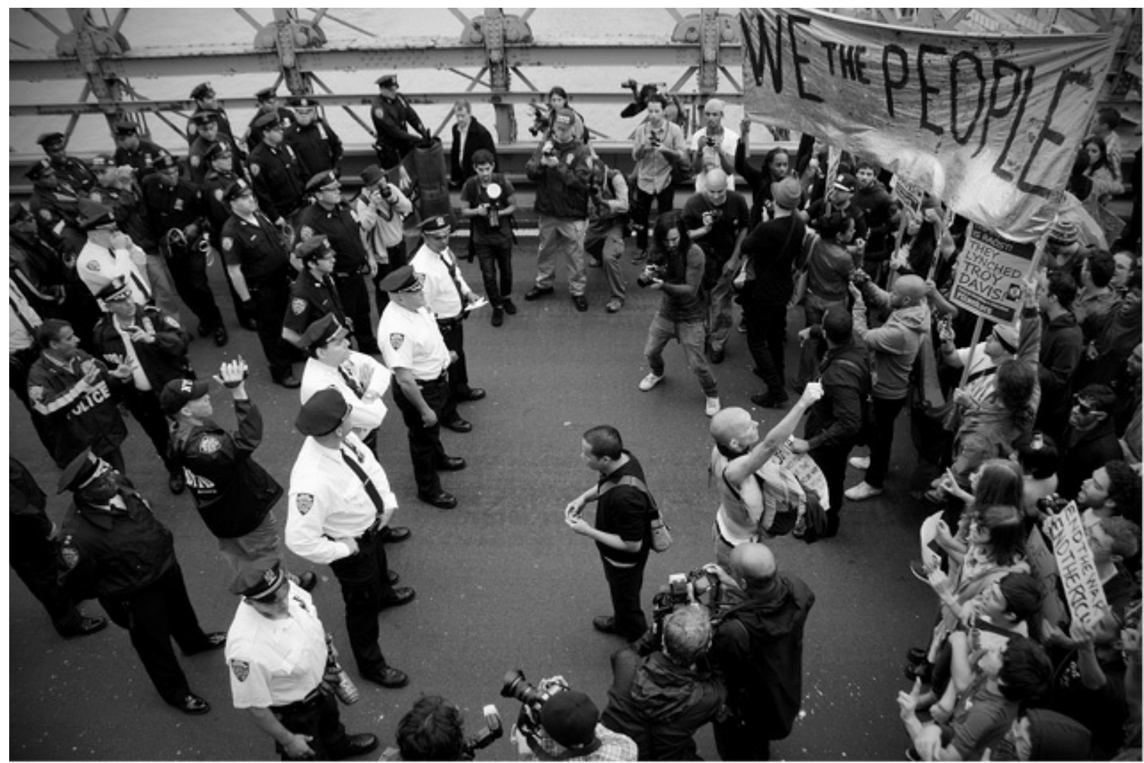
Brooklyn Bridge, October 1, 2011