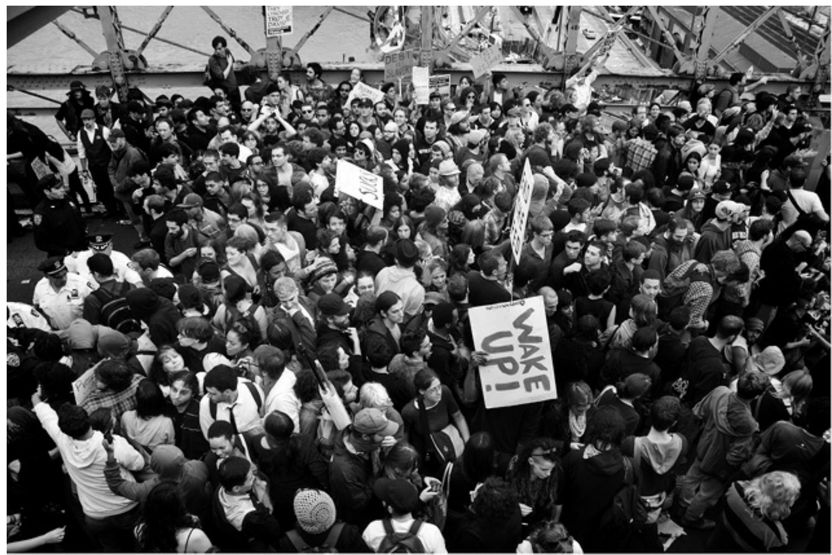
Brooklyn Bridge, October 1, 2011