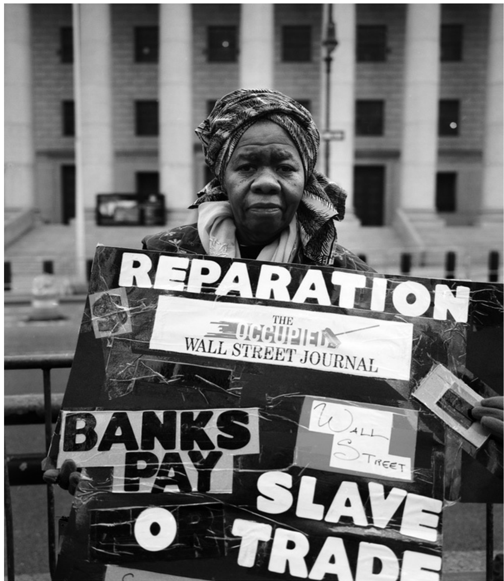
Foley Square, 2011