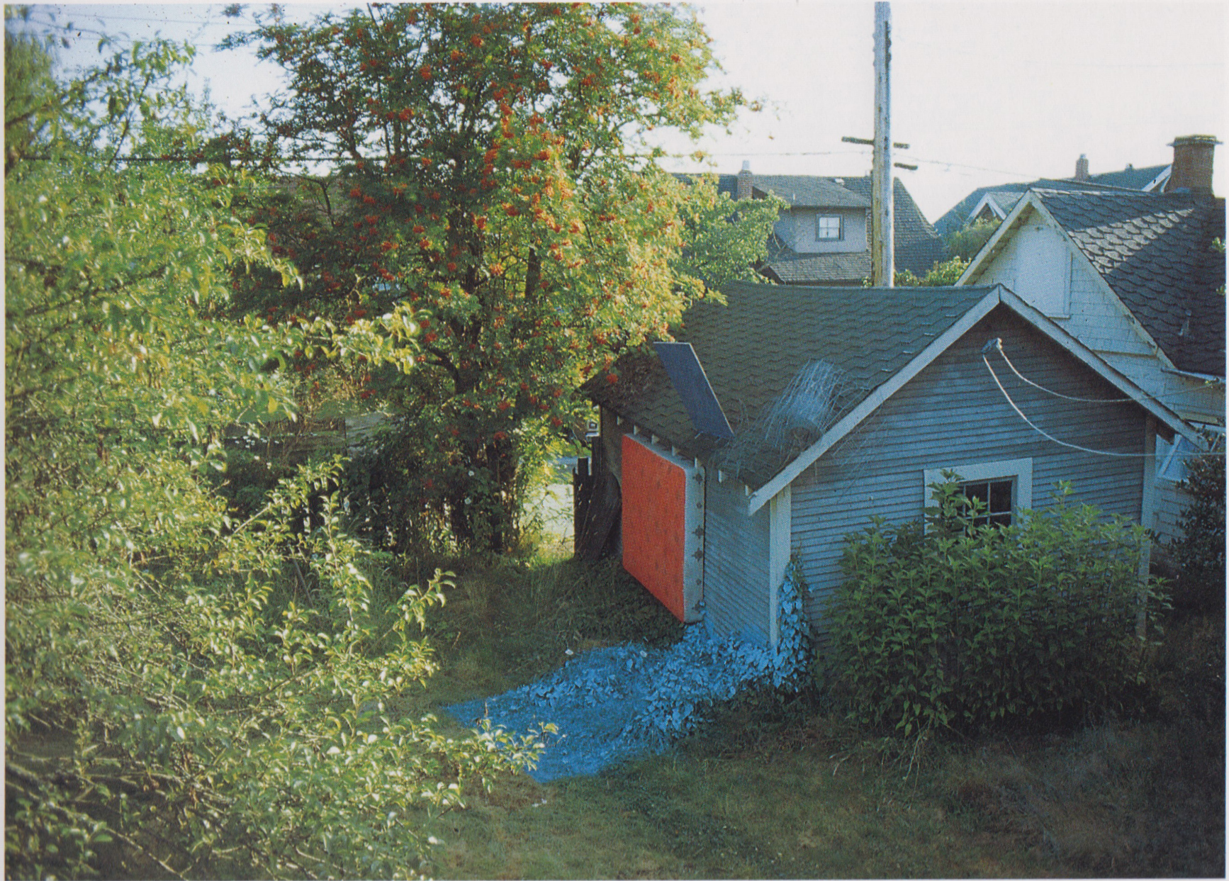
My Father's Backyard, 1983